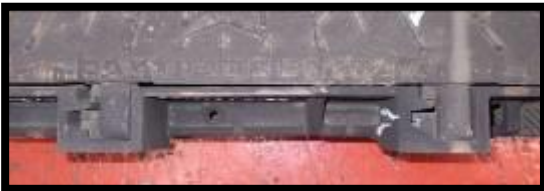
Mk 1 Opt-Emax Hinge.

There are two version of the Opt-Emax unit. On Mk1 units the two hinges on the cover are the same. On Mk2 units the two hinges are different